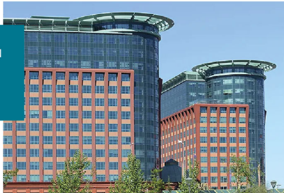
Colombo Shopping Center, LISBON

50 Air Handling Units, total volume of 600.000 m 3 /h