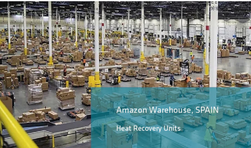
Amazon Warehouse, SPAIN Heat Recovery Units